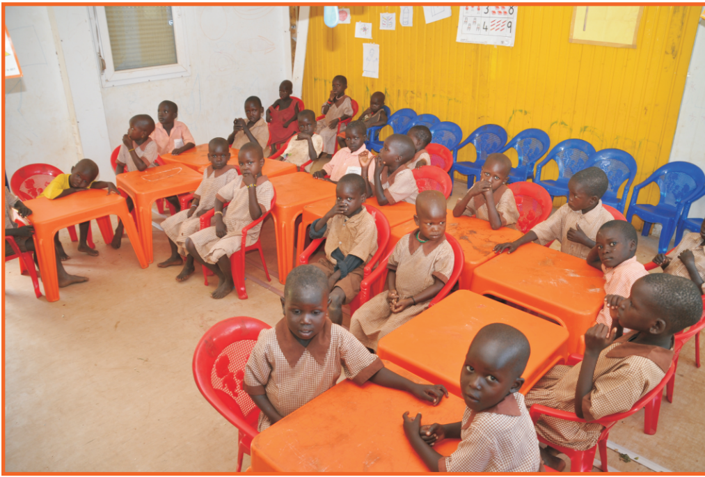
Holy Trinity Peace Village (HTPV), Kuron

Sowing the dream of a “Peace Village in Kuron we named “Holy Trinity” evolved between 1999 – 2004. It began with a demonstration farm to contribute to alleviating food insecurity among the community. As the Italians say; “good kitchen, makes good discipline”. You cannot talk to an empty stomach.